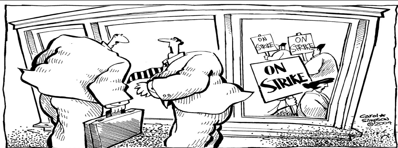
"It's not fair. We have to make up lies about the union... but they get to tell the truth about the company."